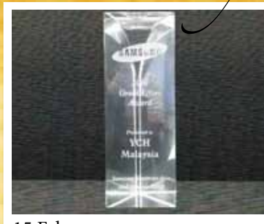
15 Feb YCH Malaysia honoured with Samsung 'Great Effort Award'