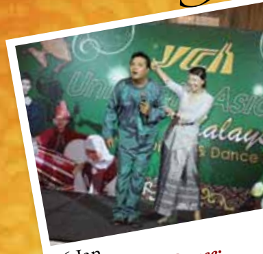
16 Jan YCH Dinner & Dance: Uniquely Asia, Malaysia