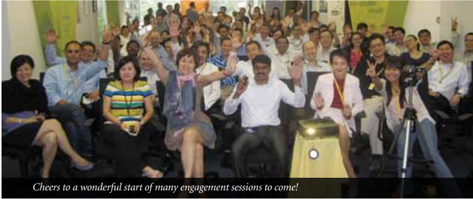
Cheers to a wonderful start of many engagement sessions to come!