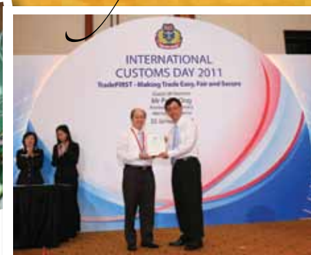
26 Jan YCH Recognised as Trusted Partner of Singapore Customs