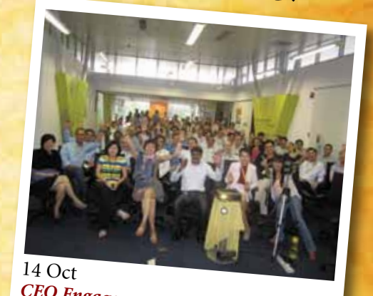
14 Oct CEO Engagement Session