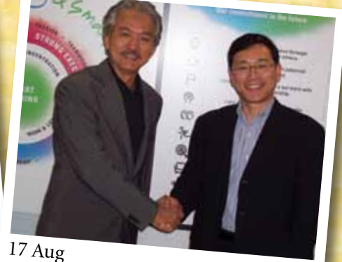
17 Aug YCH announces official partnership with LG Electronics in Australia