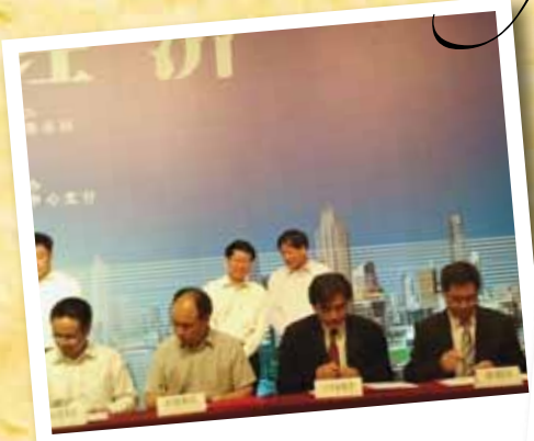
10 Aug MOU signing with Ningbo FTZ to develop Ningbo as a wine hub gateway