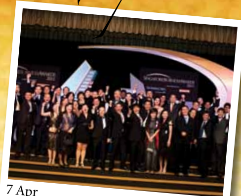
7 Apr YCH bags SBA 'Enterprise of the Year' Award