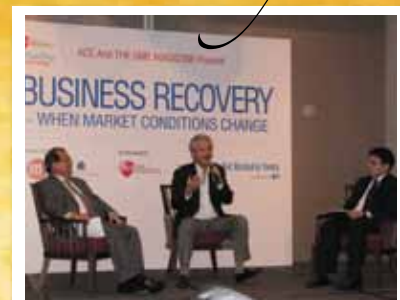
10 May ACE-BlueSky Exchange: Business Recovery – When Market Conditions Change