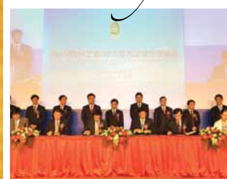
12 Jul MOU signing to establish a CSC for Kunshan City