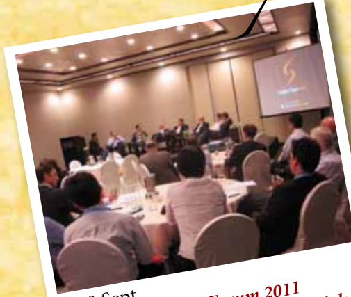
6 – 8 Sept Supply Chain Asia Forum 2011 'Extending the Chains of Life: Essentials of Supply Chains in a Globalised World'