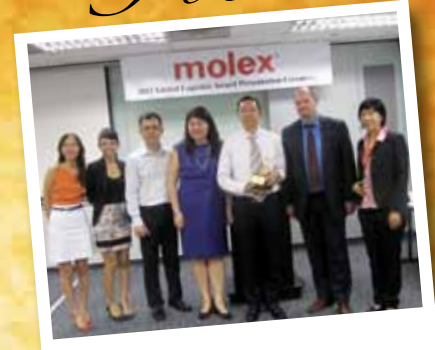
7 Jun YCH named Molex Contract Logistics Supplier of the Year