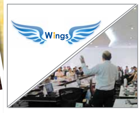
YCH Launches its WINGS team & YCH 2.0!